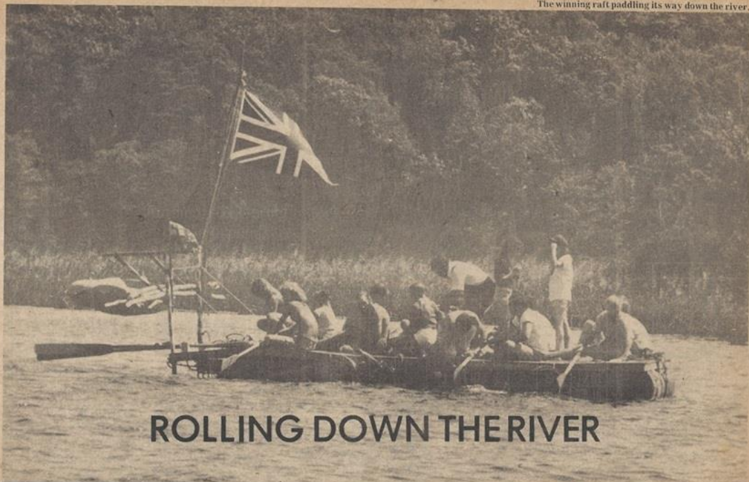
The winning raft paddling its way down the river.